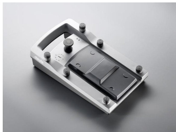
Customised user interface developments from steute Meditec nearly always use the SW2.4LE-MED wireless technology. Shown here: foot control for surgical microscopes

This service is offered by steute not only for Europe, but also for the American market if required. The company is registered as a "contract manufacturer" with the FDA within the framework of the "FDA Establishment Registration" (21 CFR 807) and, as such, can link as a