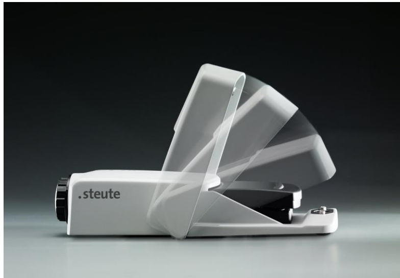
Example of a wireless standard foot switch for medical devices; the compact receiver unit is installed on the device

For the customised user interfaces in our "Custom" range, in contrast, all tests must be individually conducted and documented. In order to make it as easy as possible for device manufacturers to integrate these interfaces, steute Meditec can optionally conduct most of the mandatory testing and documentation in accordance with the abovementioned directives. From the point of view of the device manufacturer, this saves (development) time. Since steute Meditec has comprehensive experience regarding the relevant documentation, the required proof is of high quality and fulfils the appropriate requirements completely.