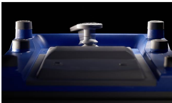
Joystick in action

Testing and documentation actually extend even further because it is also obligatory to ascertain the risks to users and/or the environment. The EN 14971 requirements for risk management (also obligatory and also requiring documentation) apply. Moreover, all user interfaces – including those with cables – must undergo a risk